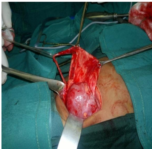
Figure 2 Intraoperative picture of giant hydronephrosis (case 2)